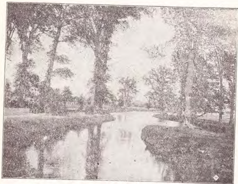
A GLIMPSE OF VICTORIA PARK, BERLIN, ONT.

Canada's Only Weekly Stamp Paper. Published at Berlin, Ont.