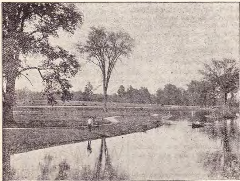
ANOTHER GLIMPSE, VICTORIA PARK. BERLIN. ONT.