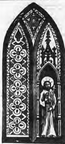
Stained Imitation Glass.