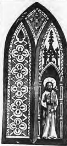
Stained Imitation Glass.

Dealer in Revenue Stamps, Assurance, Bill, Customs, Gas, Law, Match, Cigarettes, Telegraph, Beer, Tobacco, Weights & Measures, Stamps, etc. A fine collection of stamps for sale.