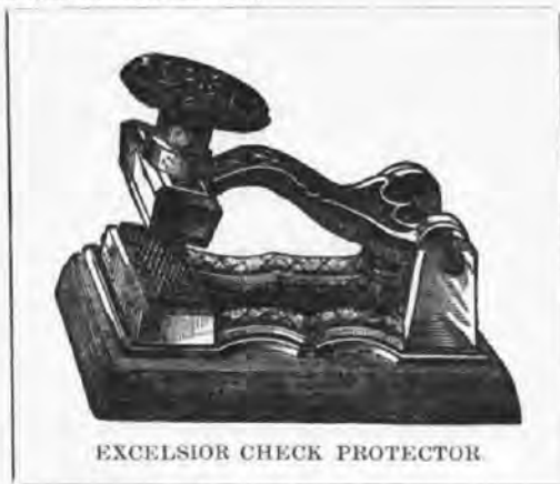
EXCELSIOR CHECK PROTECTOR.

Please note that we furnish Seals, Rubber and Steel Stamps, Checks, Stencils, Etc., at the most reasonable rates, quality guaranteed. Specimens of work will be found in our Illustrated Catalogue, sent free, including