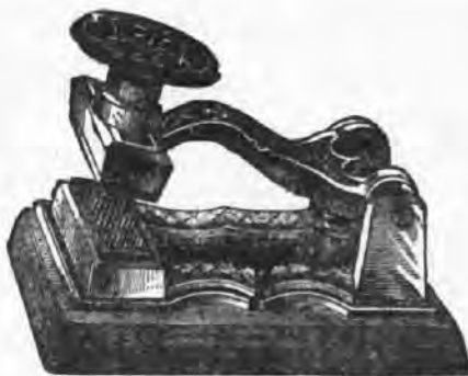
EXCELSIOR CHECK PROTECTOR.

Please note that we furnish Seals, Rubber and Steel Stamps, Checks, Stencils, Etc., at the most reasonable rates, quality guaranteed. Specimens of work will be found in our Illustrated Catalogue, sent free, including