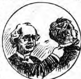
SENATOR PAYNE'S JOKE.

Perhaps it was not quite fair, but I turned my kodak loose in some of the committee rooms of the house and senate—those semi-private apartments in which statesmen do pretty much as they please. Knocking at the door of one room in the house end of the Capitol, I was bid a hearty "come in." Presenting the camera for a snap shot, I made some excuse and retired. When