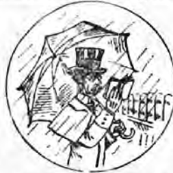
SENATOR INGALLS' RULING PASSION.

One recent day Mr. Ingalls was expected at the Capitol at 10:30 a. m. A committee meeting had been called, and