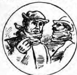
CAMPAIGN SORE THROAT.

At the Capitol the industrious little kodak found many scenes meat and fit for its devouring, but the most of these shall be saved for a future letter. The kodak is no respecter of persons, and in