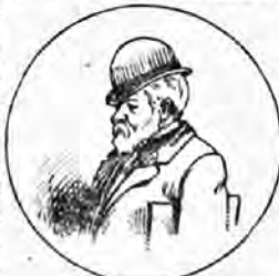
MR. BLAINE AND HIS HAT.

A good example of the latter class I saw a few minutes after passing Mr. Blaine. It was Speaker Reed starting on his daily walk to the Capitol, swinging along in his usual fashion, the rim of his derby almost touching the back of his thick neck. But unfortunately my kodak failed to