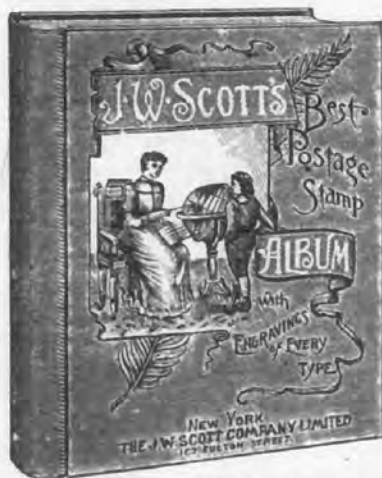
Reduced Picture of the $1.50 Edition.

Is brought up to the day of going to press and contains supplementary sheets for United States revenue stamps. The market value of every stamp is given in the space made to receive the stamp. The lightly printed cuts do not spoil the appearance of the page, and, being small, there is room for color, value