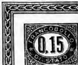
Italian Official Post Card.