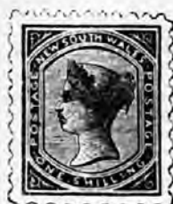
New South Wales.