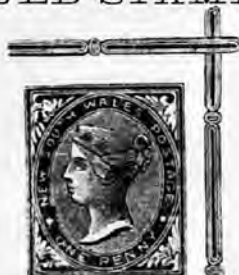
New South Wales Card.