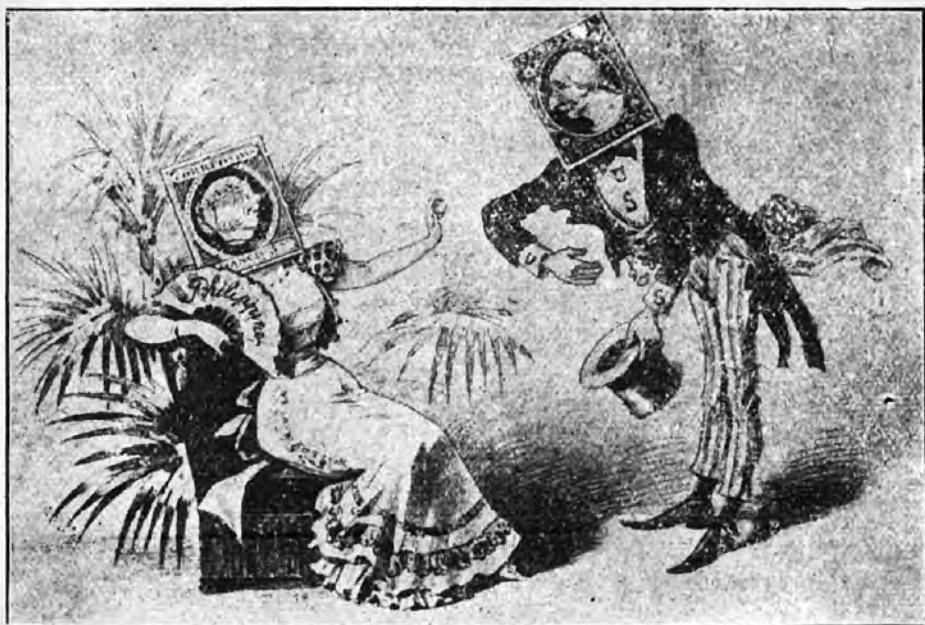
"Uncle Sam and the Phillippina."