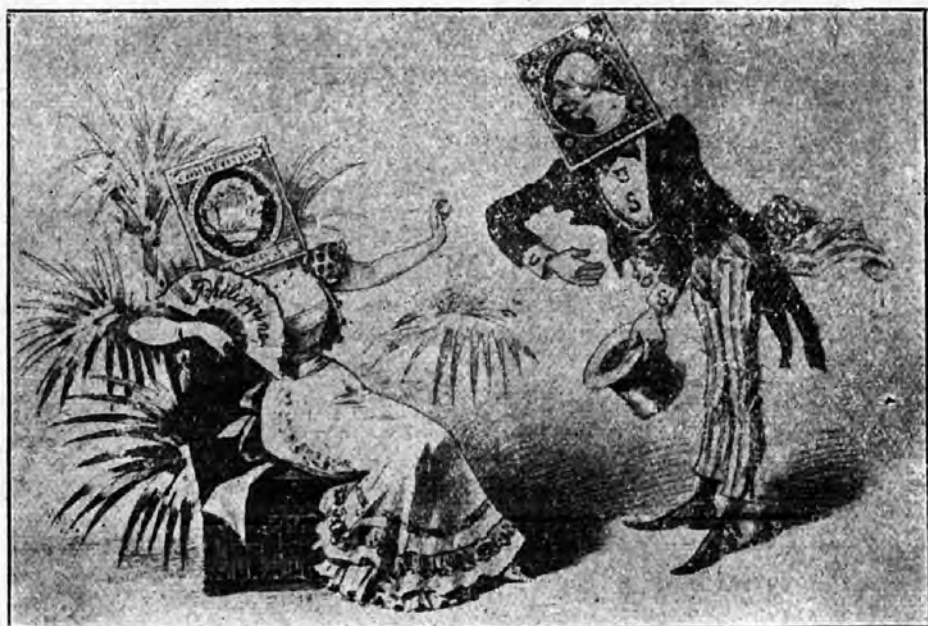
"Uncle Sam and the Phillipina."