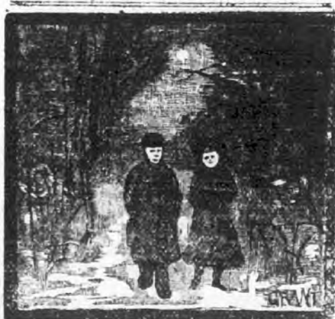
A GALLANT YOUTH(?) —Monthly Gem.