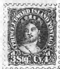
PRINCE EDWARD ISLE, 1870.