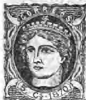
SPANISH WEST INDIES, 1870.