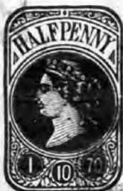
GREAT BRITAIN, 1870.