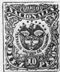
NEW GRANADA, 1870.