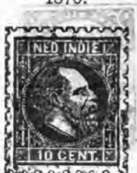
DUTCH INDIES, 1870.