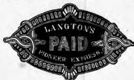
Langton's Pony Express.