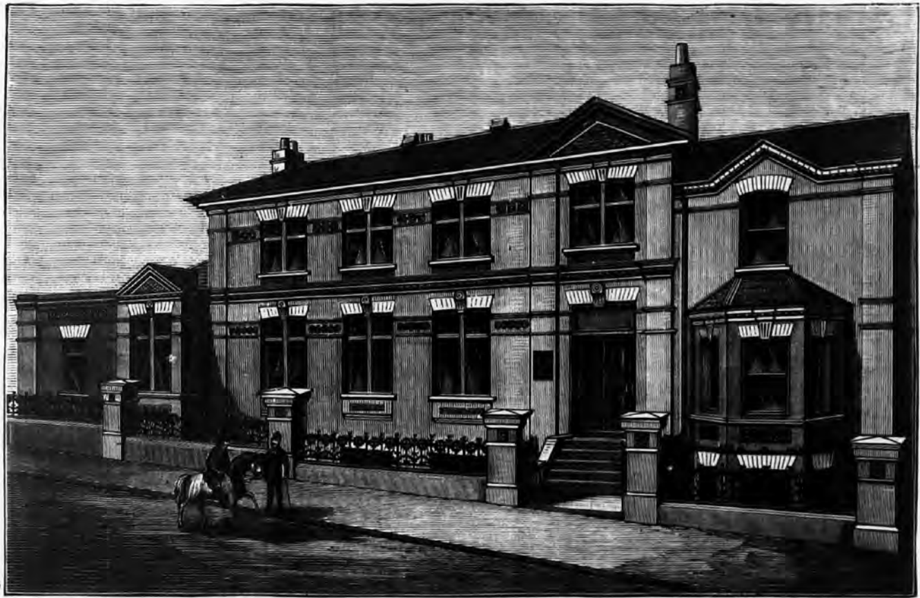
WHITFIELD KING & CO.'S NEW OFFICES, ERECTED 1887.