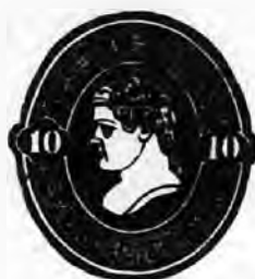
United States Envelope.