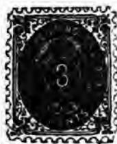
Danish West Indies.