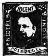
Dutch East Indies.