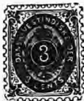
Danish West Indies.