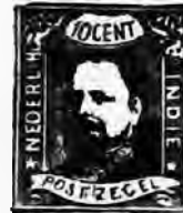
Dutch East Indies