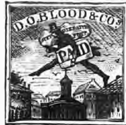
D. O. Blood's Local United States.