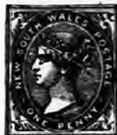
New South Wales