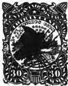
U.S. Sanitary Commission