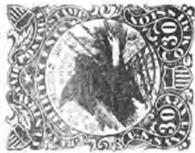
U. S. Savings Commission