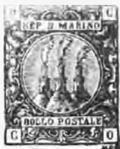
San Marino Essay.