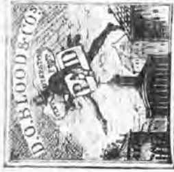
U. S. Blood & Co's New York.