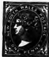
New South Wales.