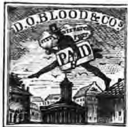
D. O. Blood's Local United States.