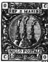
San Marino Essay