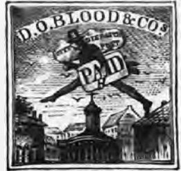
D. O. Blood's Local United States.