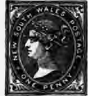
New South Wales.