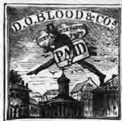
D. O. Blood's Local United States.