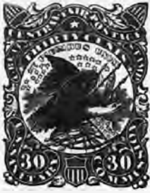
U.S. Sanitary Commission.