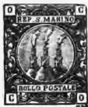
San Marino Essay.