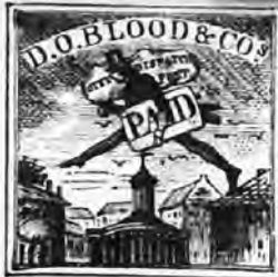
D. O. Blood's Local United States.