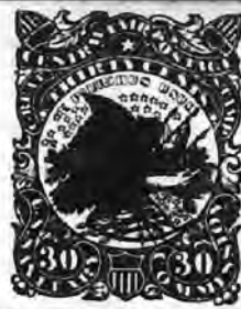
U.S. Sanitary Commission.