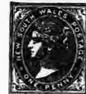
New South Wales.