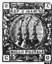
San Marino Essay.