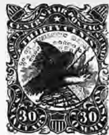
U.S. Sanitary Commission.