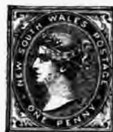
New South Wales.