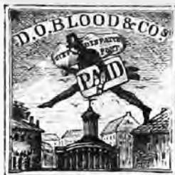
D. O. Blood's Local American.