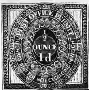
British Essay d