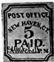
New Haven, 5 cents, £600.