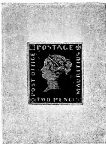
Mauritius, 2d. blue, "Post Office." Sold for £1,450.