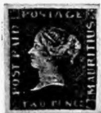
Mauritius, Post Paid, 1848, 2d., blue, £82.

Note the words POST PAID where the words POST OFFICE occurred in the first stamps of Mauritius described above.