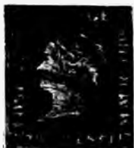
Mauritius, Post Paid, 2d., penoe (error), £51. The word PENCE was wrongly spelt PENOE.