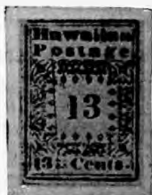
1851, 13 cents, blue, £70, used.