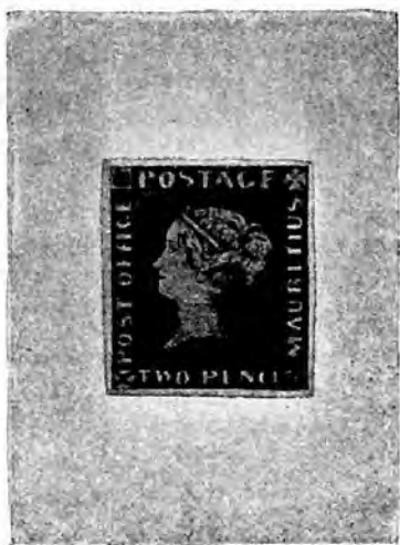
Mauritius, 2d. blue, "Post Office." Sold for £1,450.