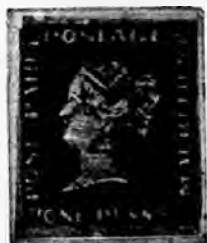
Mauritius, Post Paid, 1848, 1d., vermilion, £20.

H.R.H. the Prince of Wales has a fine copy of each of the stamps. The 1d. red one was purchased for £850. The 2d. blue one illustrated on our cover was purchased at public auction for the Prince's collection, the price paid being £1450. The 2d. blue shown above is in the Tapling Collection in the British Museum.