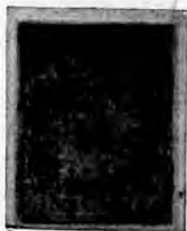
1852-3, 13 cents, £85, used.