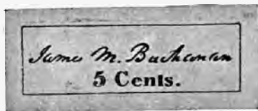
Baltimore, 1846, 5 cents. black, £80.