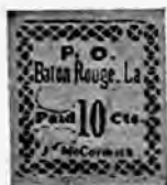
Baton Rouge, 10 cents, blue, £275.