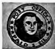
Millbury (Massachusetts) local stamp, £400. About half a dozen copies known.