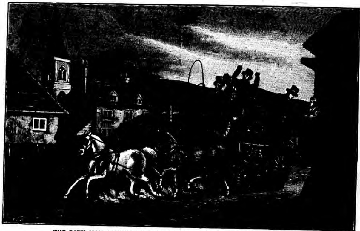
THE BATH MAIL PICKING UP BAGS AT A WAYSIDE OFFICE WITHOUT STOPPING.