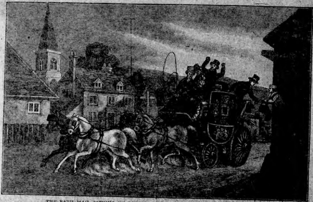
THE BATH MAIL PICKING UP BAGS AT A WAYSIDE OFFICE WITHOUT STOPPING.