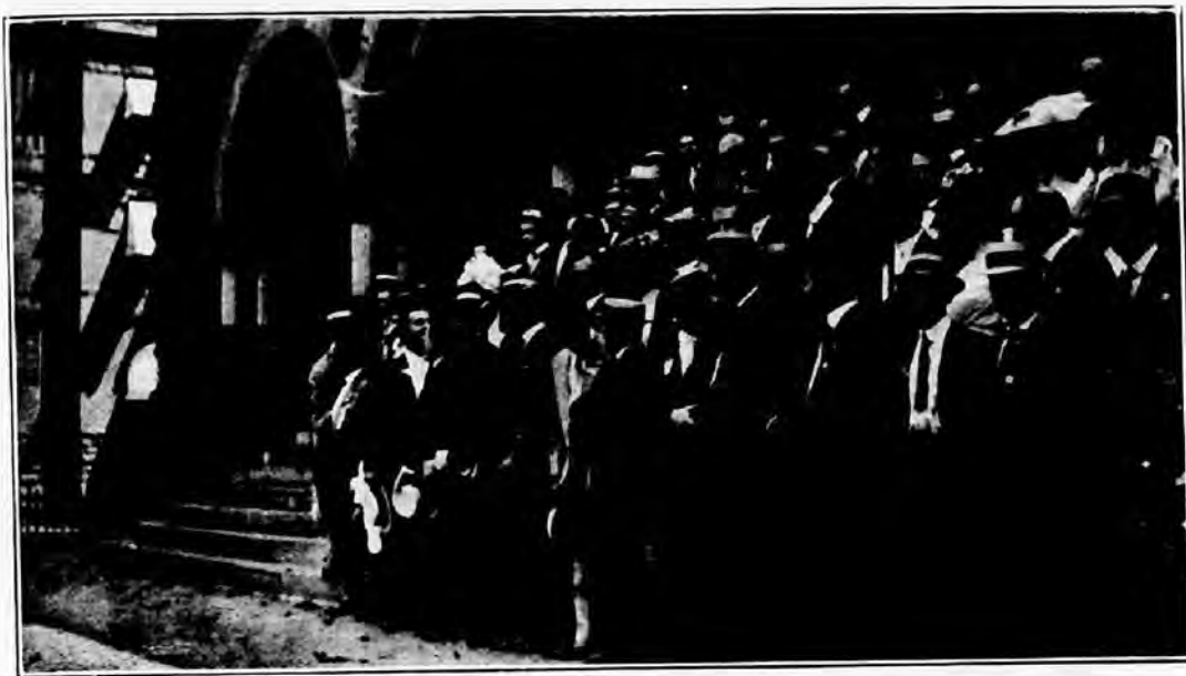
Getting Ready for the Convention Photo