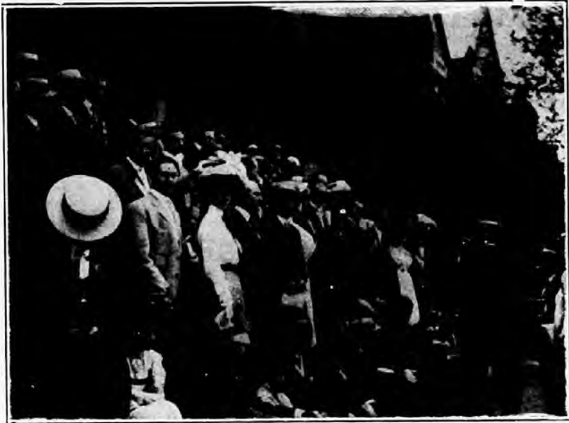
Waiting for some of the late ones.