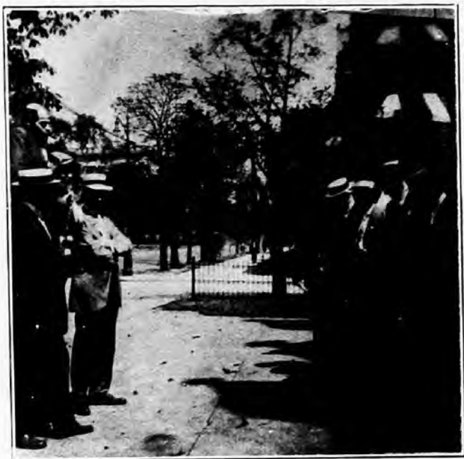
A Crowd of Camera Enthusiasts Snapping a Typical Group