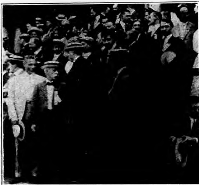
Getting Ready for the Convention Photo. Pick 'em out.