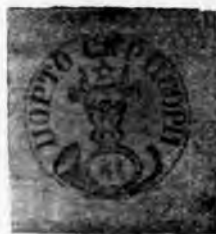
ROUMANIA. The issue for Moldavia. This 81 paras stamp has been sold unused at prices varying from £100 to £320. Several fine copies are to be seen in case II., slides 744, 745.

The so called "Woodblock" stamp. The rare errors of colour, 1d. printed in colour of the 4d. blue, and the 4d. printed in colour of the 1d. red, may be seen in case I., slide 144.