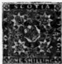
NOVA SCOTIA, 1851. 1s. violet, worth £36, case II., slide 646.

A nice series of the suppressed College Stamps of Oxford and Cambridge may be seen in case I., slides 343 to 345.