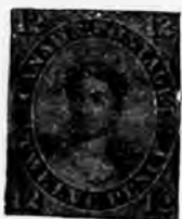
The Canada 12d. black is worth £70, and several may be seen in case I, slide 137.