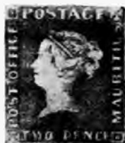
The 2d. "Post Office" Mauritius. This very fine copy, almost equal to the one sold in January of 1904 for £1,450, is to be seen in the Cracherode Room.