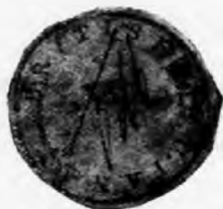
BRITISH GUIANA. Two cents rose, a pair of which once sold for £1000, may be seen in the Cracherode Room.