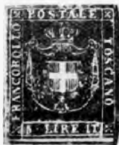
TUSCANY Three lire yellow. Worth £75. Case III., slides 1009, 1010.