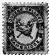
GREAT BRITAIN COLLEGE STAMP.

A nice series of the suppressed College Stamps of Oxford and Cambridge may be seen in case I., slides 343 to 345.