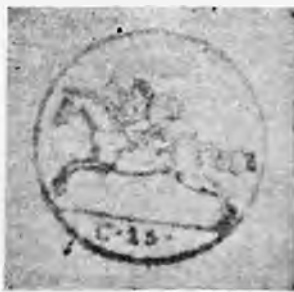
SARDINIA. Design on the letter sheets issued prior to the introduction of Rowland Hill's scheme for adhesive postage stamps Date 1818. See case III., slide 1121.