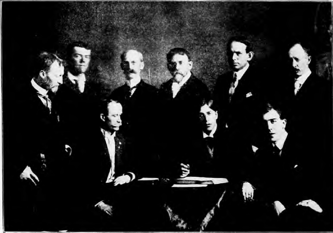
Officers of Denver Stamp Club and Members of the Arrangement Committee, 22nd Annual Convention American Philatelic Association, Denver, July 29th to August 1st, 1907