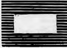
Used in Scotland.