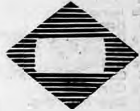
Used in Ireland.