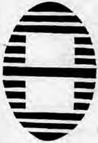
Used in London District Offices and in places within their delivery.

It sometimes occurs that the Stamps on letters used to denote the places at which such have been posted are not sufficiently plain. In such cases the stamp used to obliterate the postage label may supply the information. The shape of the stamp and its number will prove the office in which it has been used. The following are fac similes of the obliterating stamp :—