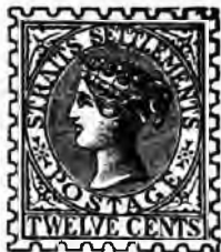
Wmk., C. C. and Crown.