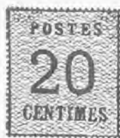
ALSACE AND LORRAINE.