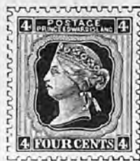
PRINCE EDWARD ISLAND.