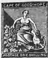
CAPE OF GOOD HOPE.