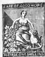
CAPE OF GOOD HOPE.