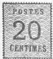
ALSACE AND LOZRAINE.