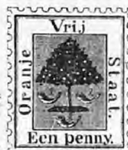
ORANGE FREE STATE.