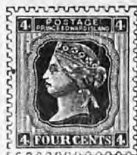
PRINCE EDWARD ISLAND.