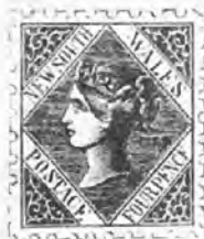
NEW SOUTH WALES.