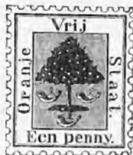
ORANGE FREE STATE.