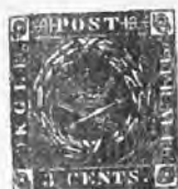
DANISH WEST INDIES.