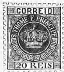
ST. THOMAS & PRINCIPLE.