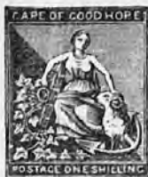
CAPE OF GOOD HOPE.