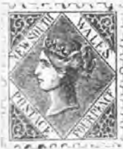
NEW SOUTH WALES.