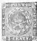
DANISH WEST INDIES.