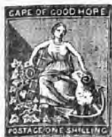
CAPE OF GOOD HOPE.