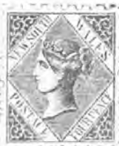
NEW SOUTH WALES.