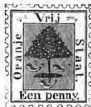
ORANGE FREE STATE.