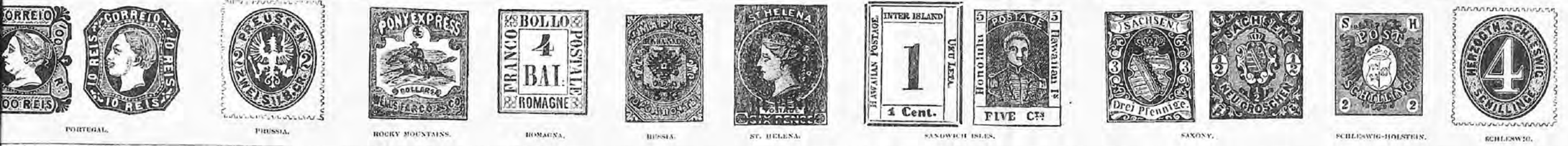
PORTUGAL. PRUSSIA. ROCKY MOUNTAINS. ROMAGNA. RUSSIA. ST. HELENA. SANDWICH ISLES. SAXONY. SCHLESWIG-HOLSTEIN. SCHLESWIG.