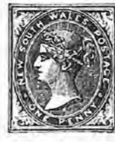
NEW SOUTH WALES.