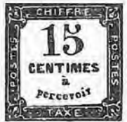
FRANCE. UNPAID LETTER STAMP.