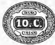
ITALY. UNPAID LETTER STAMP.