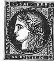
FRENCH REPUBLIC ESSAY.