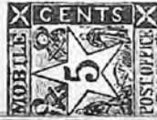
MOBILE CENTS POSTOFFICE