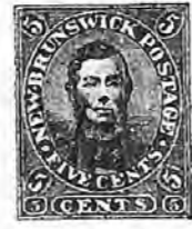
NEW BRUNSWICK ESSAY.