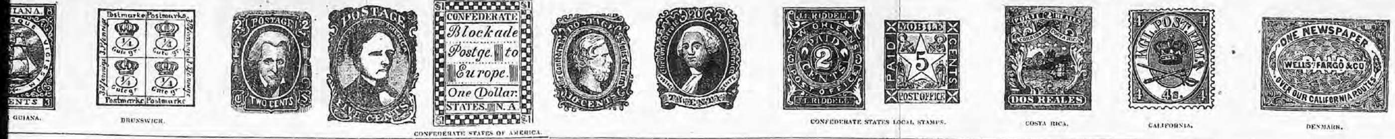
GUIANA. BRUNSWICK. CONFEDERATE STATES OF AMERICA. VINCENT. CONFEDERATE STATES LOCAL STAMPS. COSTA RICA. CALIFORNIA. DENMARK.