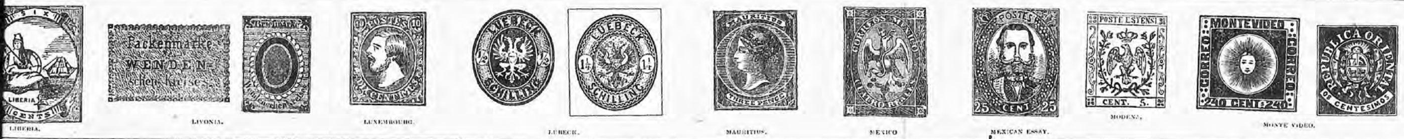
LIBERIA. LIVONIA. LUXEMBOURG. LUBECK. MAURITIUS. MEXICO. MEXICAN ESSAY. MODENA. MONTEVIDEO.