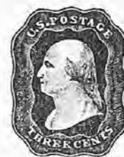
UNITED STATES ESSAY.