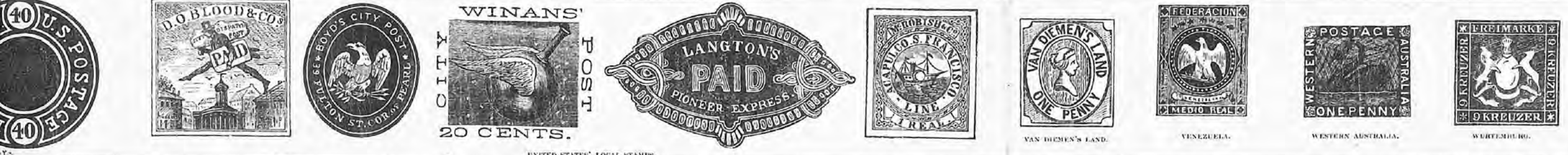
UNITED STATES' LOCAL STAMPS. VAN DIEMENS' LAND. VENEZUELA. WESTERN AUSTRALIA. WURTEMBERG.