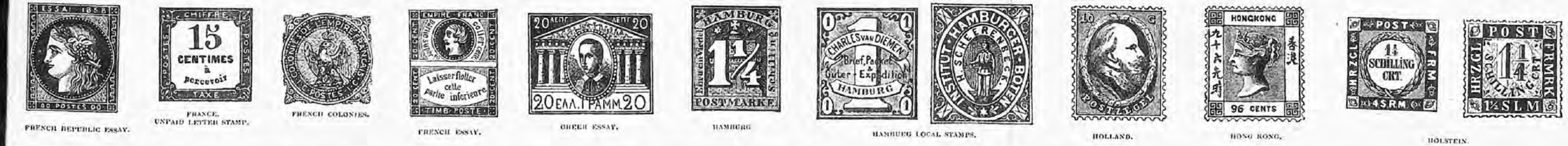
FRENCH REPUBLIC ESSAY. FRANCE. UNPAID LETTER STAMP. FRENCH COLONIES. FRENCH ESSAY. OBER ESSAY. HAMBURG. HAMBURG LOCAL STAMPS. HOLLAND. HONG KONG. HOLSTEIN.