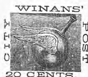
UNITED STATES LOCAL STAMPS.