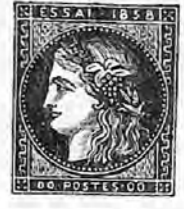
FRENCH REPUBLIC ESSAY.