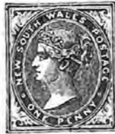
NEW SOUTH WALES.