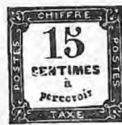
FRANCE. UNPAID LETTER STAMP.