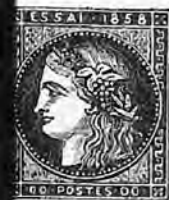
FRENCH REPUBLIC ESSAY.