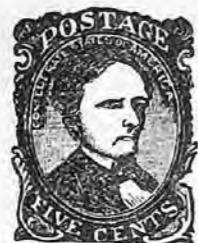
CONFEDERATE STATES OF AMERICA.