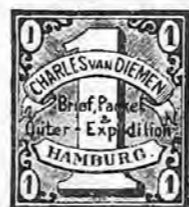
HAMBURG LOCAL STAMPS.