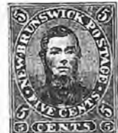
NEW BRUNSWICK ESSAY.