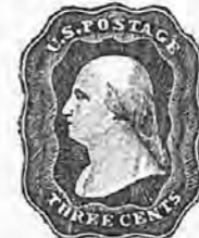
UNITED STATES' ESSAYS.