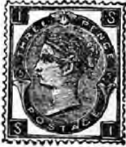
Large White Letters in Corners.