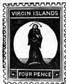
Similar to Cut.