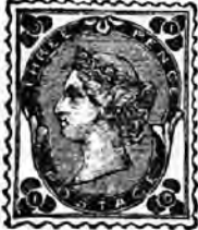
Letters in all Corners.