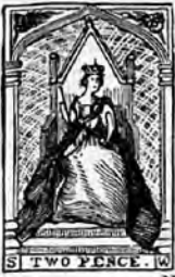
Similar to Cut.