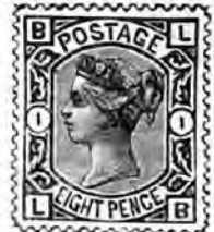
Large Colored Letters in Corners.