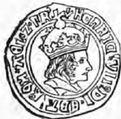
Henry VII Shilling.