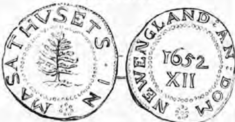
Pine Tree Shilling.

AN AGENT WANTED in every town. Splendid chance to make money. For particular address Manager "EXCHANGE AND MARKET," 77 Nassau St., New York City.