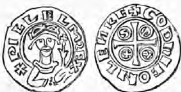
William 1st, Penny.

Specimen of Coin Illustrations appearing in the Exchange and Market.