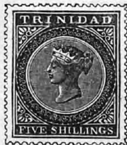
5 shillings, lake.....