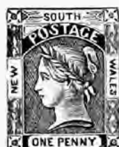
NEW SOUTH WALES, 1850-3.