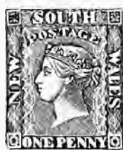
NEW SOUTH WALES, 1856.