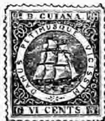
BRITISH GUIANA, 1865.