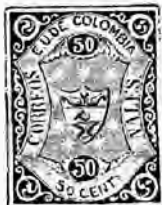
NEW GRANADA, 1865.