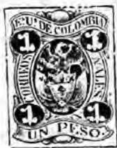
NEW GRANADA, 1867