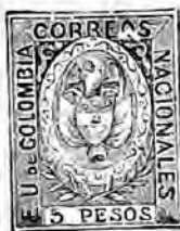
NEW GRANADA, 1868.