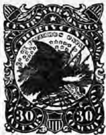
U.S. Sanitary Commission.