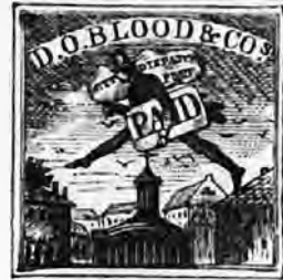
D. O. Blood's Local United States.