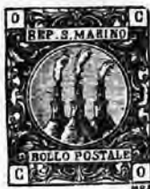
San Marino Essay.