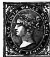
New South Wales.