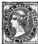
New South Wales.