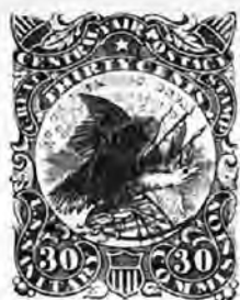
U.S. Sanitary Commission.