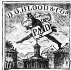
D. O. Blood's Local United States.