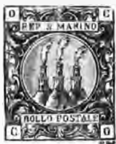
San Marino Essay.