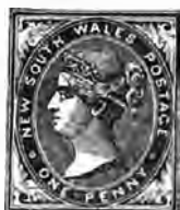
New South Wales.