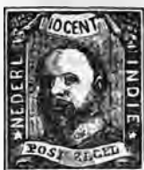
Dutch Indies. ADHESIVE STAMPS.