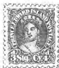
PRINCE EDWARD ISLE, 1870.