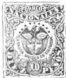
NEW GRANADA, 1870.