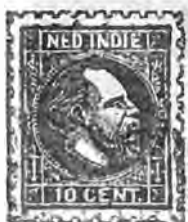
DUTCH INDIES, 1870.