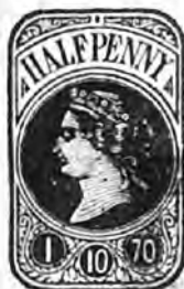
GREAT BRITAIN, 1870.