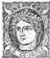
SPANISH WEST INDIES, 1870.